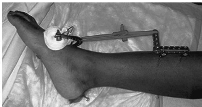
FIGURE 2. Clinical photograph depicting construct using anterior elastic tubing.

Attention is then turned to the distal construct. An appropriately sized distal oval ring consisting of 2 half-rings and 2 plates is constructed from Ilizarov components. The distal half-ring arches over the foot dorsally and the posterior ring passes posterior to the calcaneus in the axial plane (the